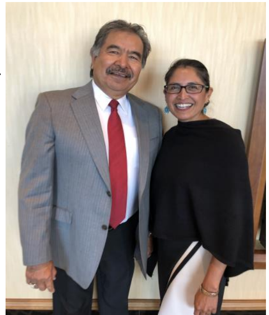
The Honorable Albert Hale, former President of Navajo Nation and Arizona State Senator and Representative, joins keynote speaker Hilary Tompkins

Meeting on June 5 th at Twin Arrows, the NNBA Board of Bar Commissioners voted to adopt the first component of the Yazzie Plan to strengthen the Navajo Bar Examination. The Plan, which is being spearheaded by the Honorable Robert Yazzie, Chief Justice Emeritus of the Navajo Supreme Court, is aimed at closing the performance gap between attorneys and tribal court advocates by emphasizing the increased importance of Diné Fundamental Law and its practical application to the Navajo Justice System. As part of these reforms, the BOBC voted to reduce the number of subjects tested on the semi-annual NNBA exam from approximately 25 to 14 total subjects. This is much more in keeping with the bar exams of neighboring jurisdictions, which test between six and a dozen subjects. For more information on the Yazzie Plan, and to get more involved, go to www.navajolaw.info .