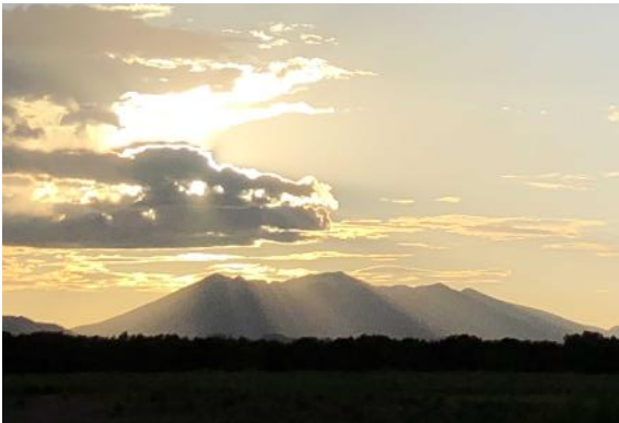
Dóók'ód'slíid at dusk on the opening day of the NNBA conference

The verdict on this year's NNBA annual conference is in, and it's good news for NNBA members. The conference, held at Twin Arrows Resort and Conference Center on June 6-7, record member attendance and a netted more than $20,000 in additional profit for our organization compared to just two years ago.